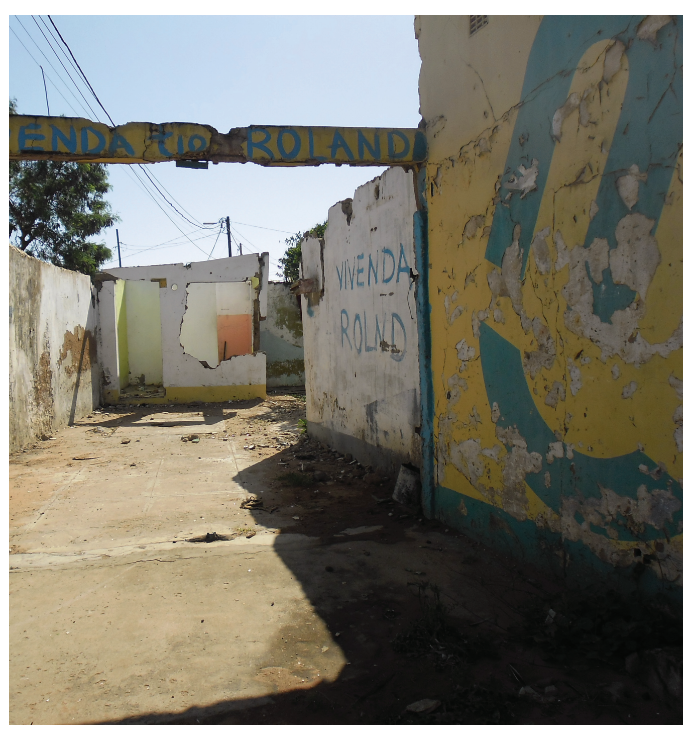
(Dulce, Photo 4)

I understand that the buyer demolished the house and needed to rebuild, but this kind of situation creates a lot of insecurity especially among women in the community. I feel safe at home. In the area where I'm at, crime is not too bad there. The unsafe areas are where you can only go through alleys. Some people have to go through there every day just to get into their homes – Dulce