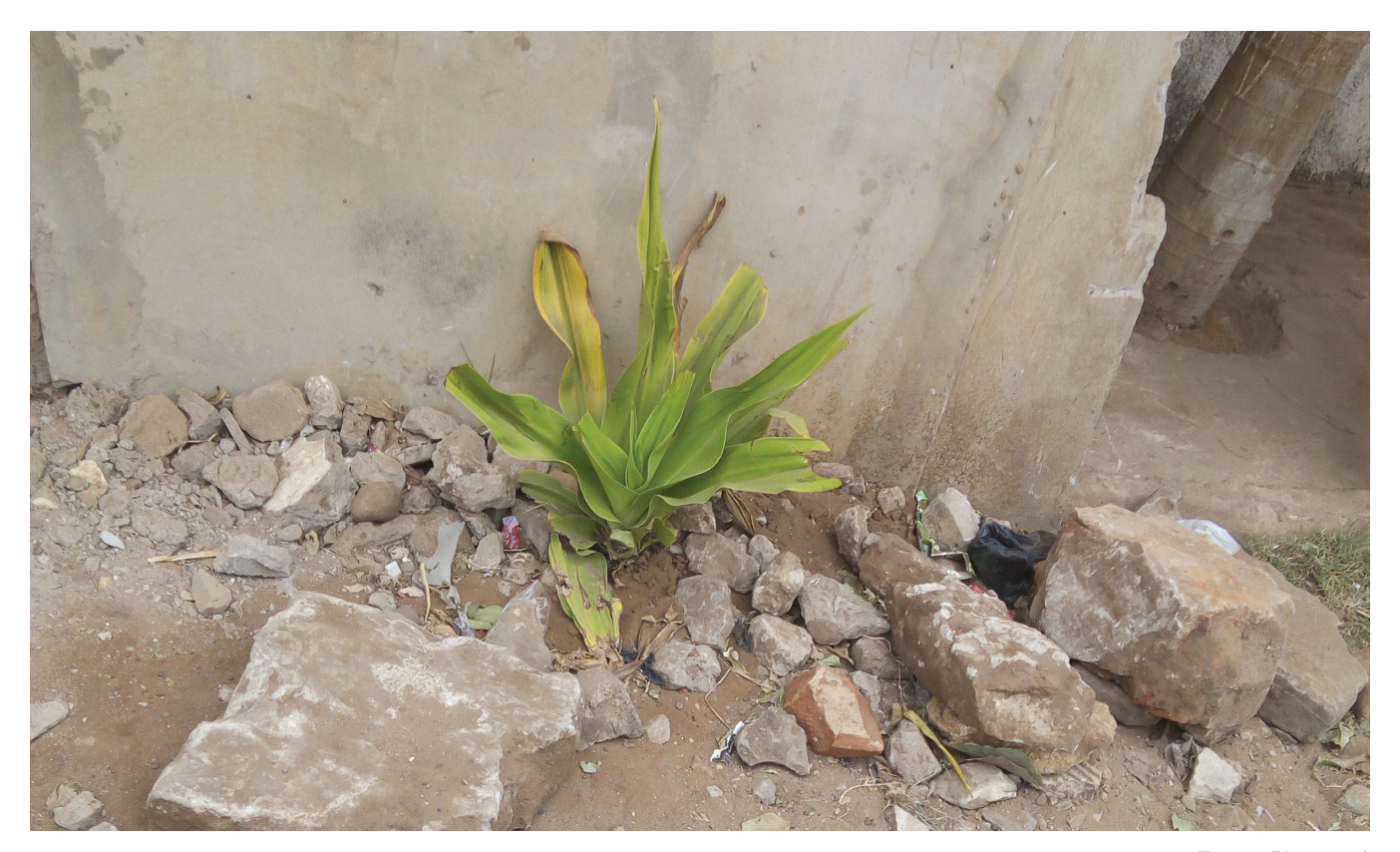
(Berta, Photo 13)

The plant is kept safe by stones, like the government that promotes security by weapons and not by freedom, as free citizens. On one hand the plant is zealous and on the other hand she is a stifled plant. Taking only into account the exterior and not the welfare of the nation – Berta