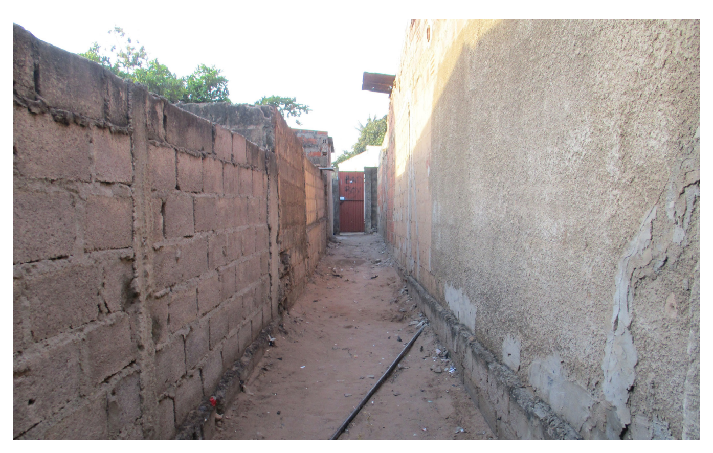
(Diolene, Photo 1)

This little very dark hallway leads to a house. Every once in a while, men smoke, they drink, and they stay there. I was so scared to be there, any girl who passed by to access their own house, they were catcalled and harassed – Diolene