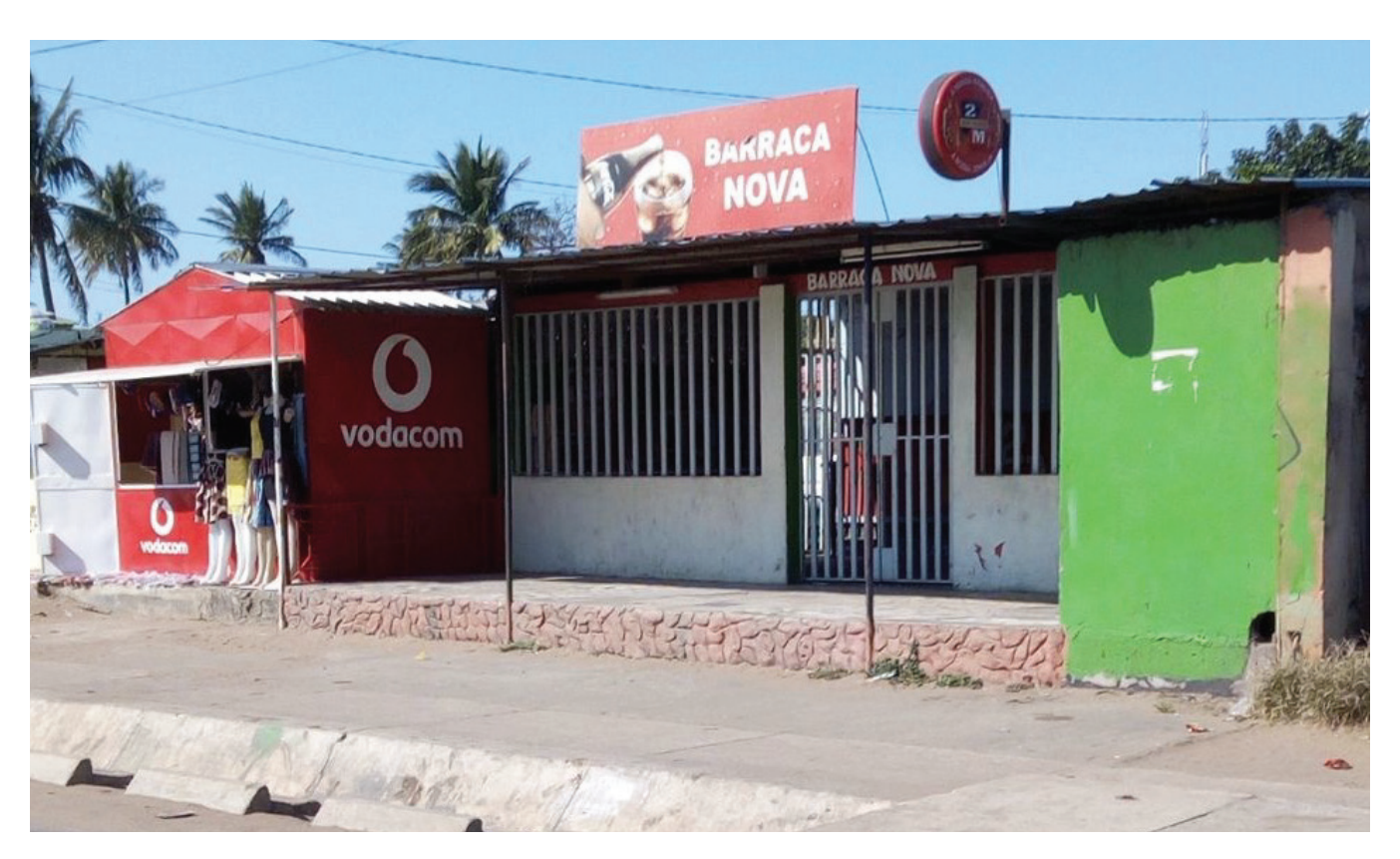
(Berta, Photo 5)

This photograph is a night space, a bar that young people use as a place of leisure. These kinds of bars can also be thought of as spaces that naturalize violence. This particular bar is frequented by young people, and young women and girls are understood as easy targets. If you are raped at this bar, it will be seen as justified violence by asking what were you doing there, what did you want there? In this space physical violence occurs, if the woman refuses, she is booed, because it presupposes that we should accept such attacks – Berta