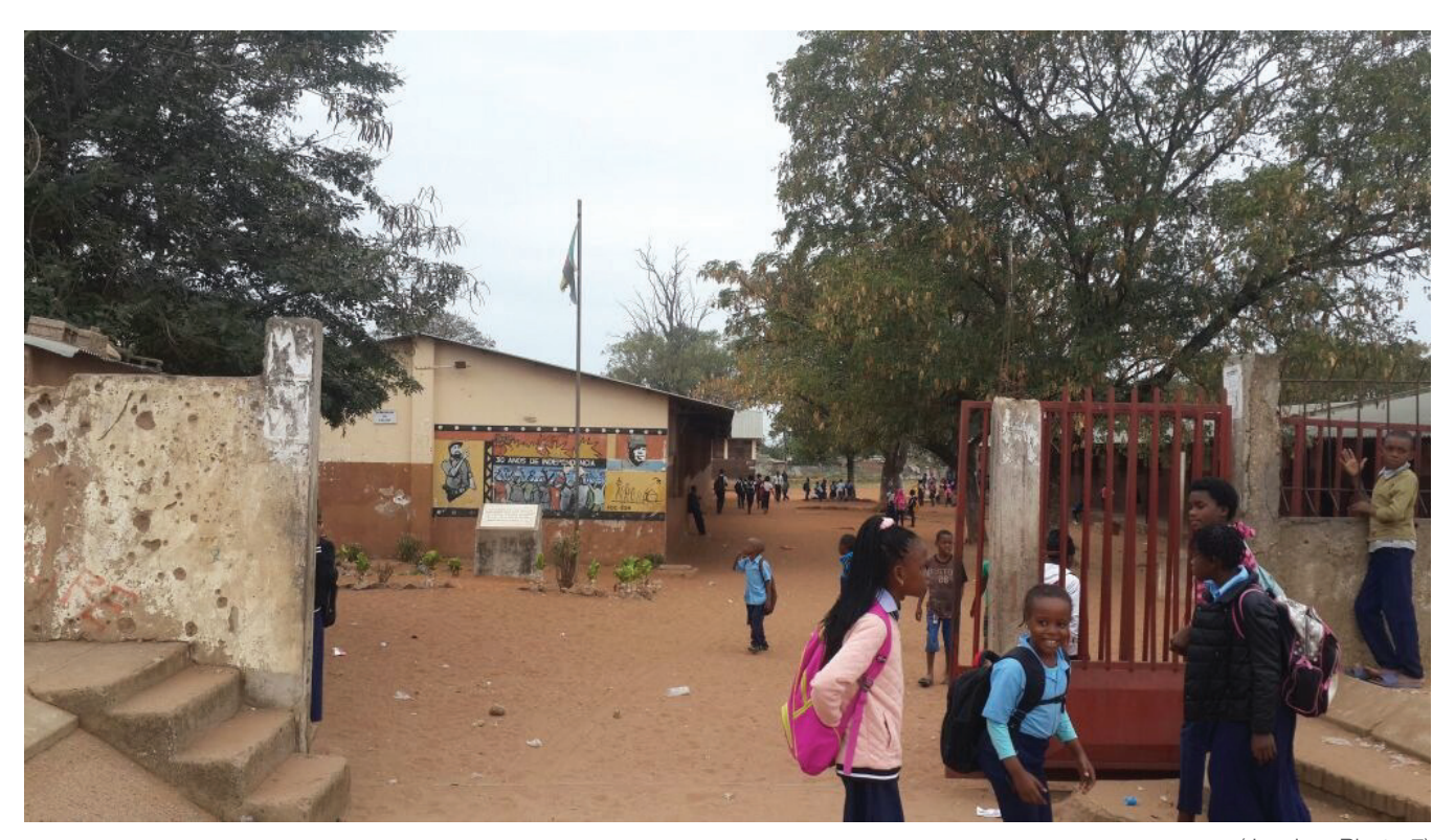
(Jessica, Photo 7)

When reflecting on the theme of security, and how young women and girls experience security in schools, participants shared that schools are not often "looked after", leaving young people to feel unprotected and uneasy. For example, Jessica captured her view in Photo 7 as follows: