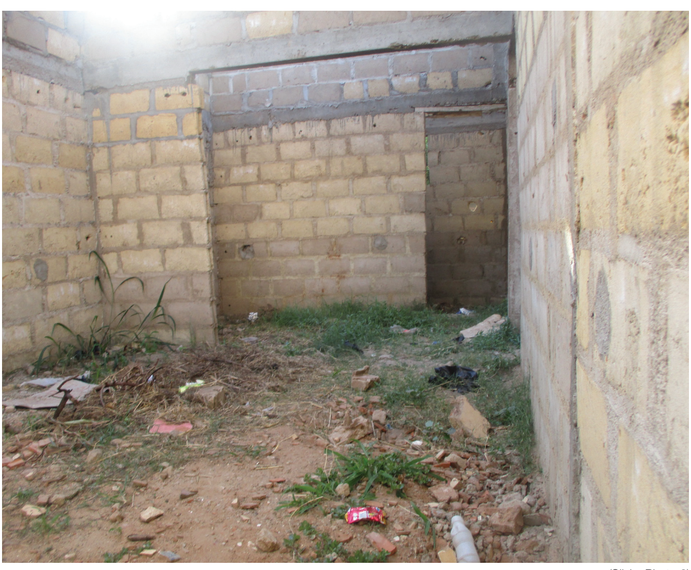
(Silvia, Photo 3)