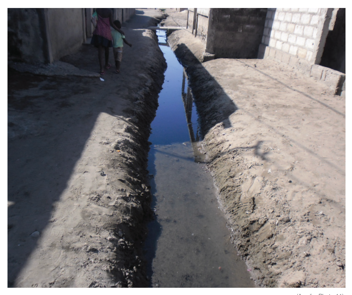
(Arcelia, Photo 11)

People use this ditch to throw dirty water, waste, they pee, defecate, do many things. Thus, this [polluted ditch] is a kind of violence. If our community receives a visitor, a Minister for instance [...], and then they come to our neighborhood and see our ditches, very polluted and dirty, it becomes a source of low self-esteem for our community – Arcelia