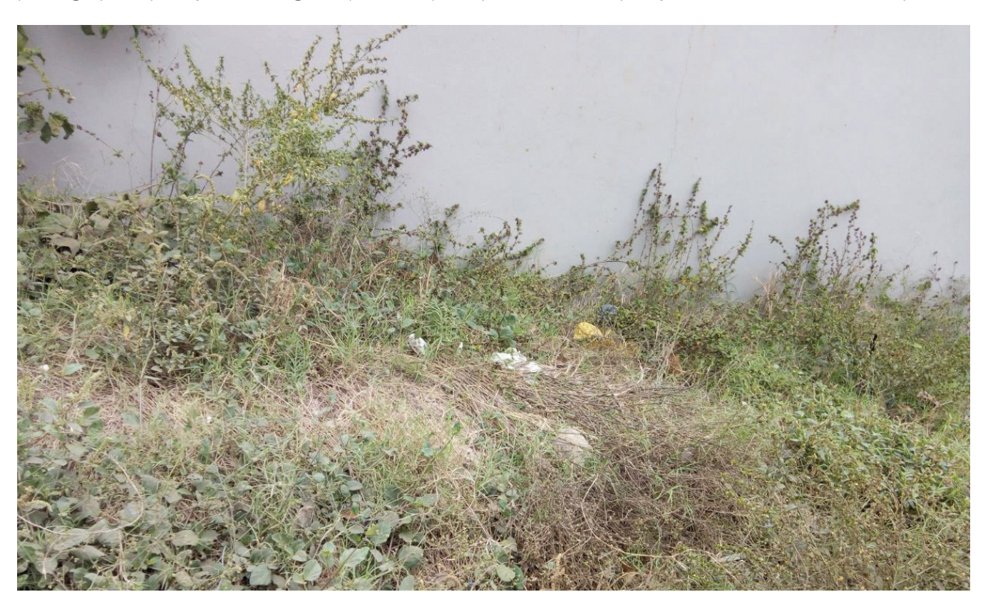
(Filomena, Photo 10)

While the theme of social inequality came through in the multiple group discussions about peace and security, the photographs served as prompts for such discussions and ranged from the literal to the symbolic. Some women took photographs of nature to represent social inequality and stratification. For example, Filomena photographed poorly cared for grass (Photo 10) to represent the inequality she feels in her life. She explained: