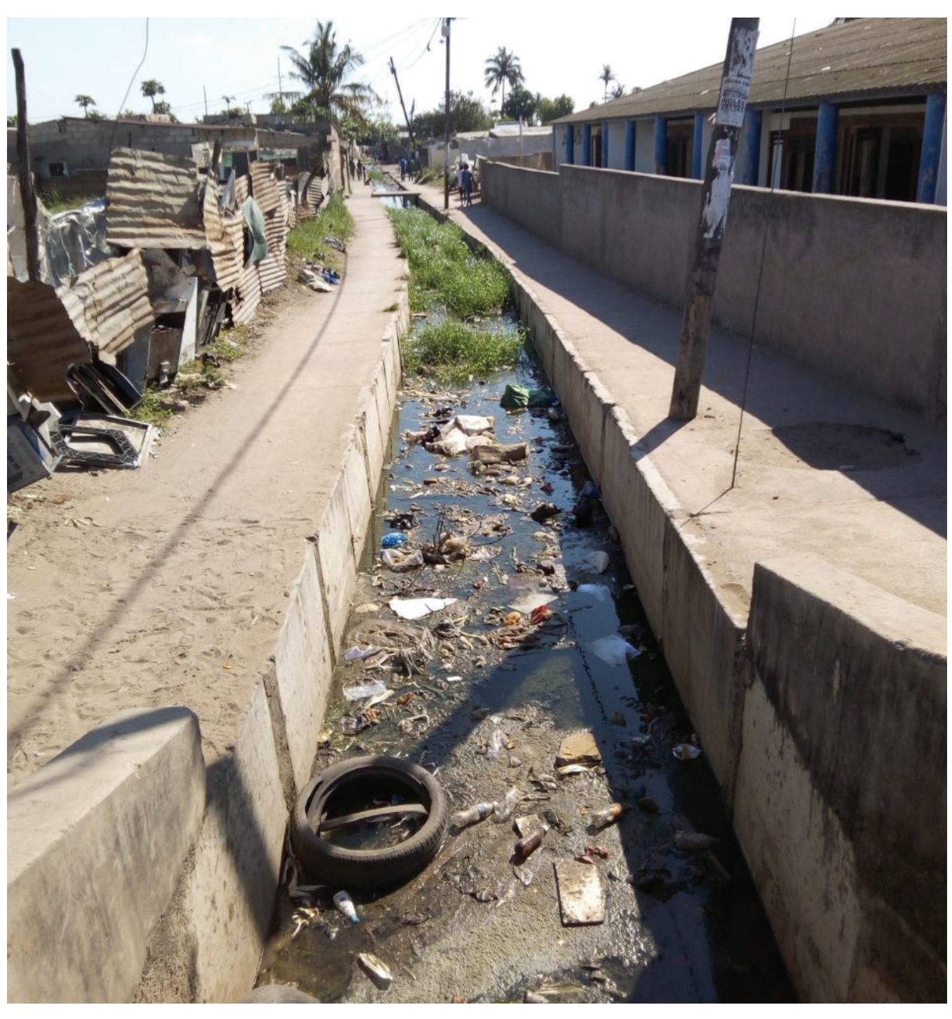
(Berta, Photo 2)

In this picture, I was thinking about the locations and types of violence that occur in my neighborhood. This is a ditch, next to a school with intense daily movement of children and adolescents. Here many girls have been raped. This photo illustrates the space. But it is at night that violence happens here. It is a space where people can do whatever they want, regardless of the law. It is a space of abandonment. This street by chance is one of the ways that gives access to many other places in the neighborhood. It could be a place of tranquility but it does not bring that feeling – Berta