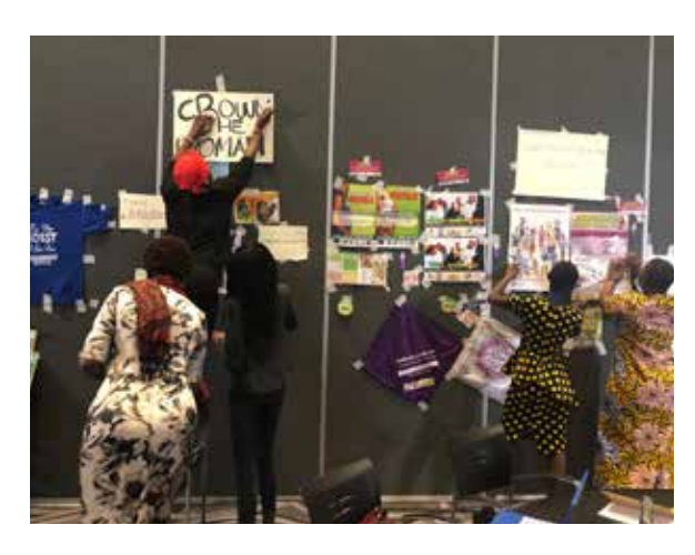
Participants from Crown the Woman and Coast Women in Development create their Peace Walls

t-shirts from a range of years to showcase their youth outreach mechanisms. Likewise, the HOFNA team from Cameroon brought a suitcase full of canvases of artwork made by the young girls they work with in their mentorship program, depicting their experiences of gender oppressions and their hopes and dreams for equitable futures.